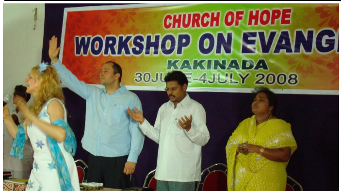
Four pastors workshops to be held to equip Indian pastors