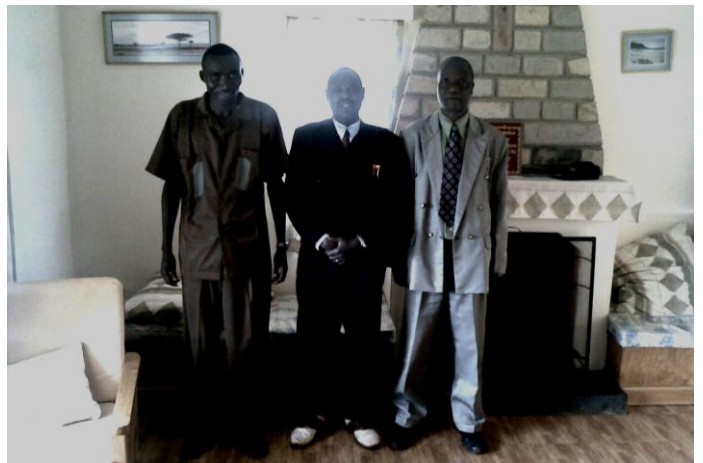
Kitale Bible College Board of Directors meeting together

Over 200 million people speak Swahili in East Africa. The manuals have begun to be translated into Swahili. However this work cannot continue until the translator receives $ A 700 for this job.